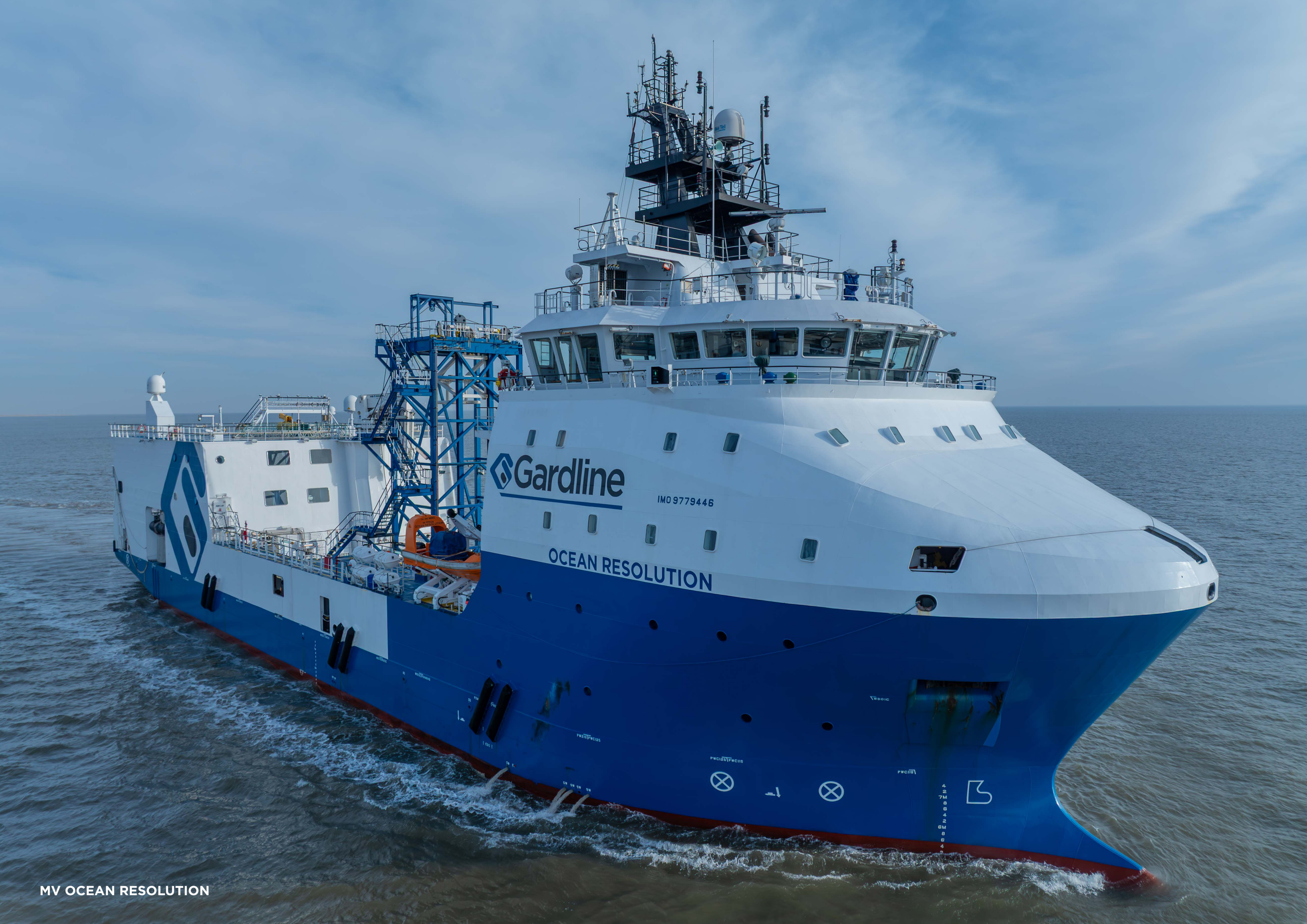
MV OCEAN RESOLUTION