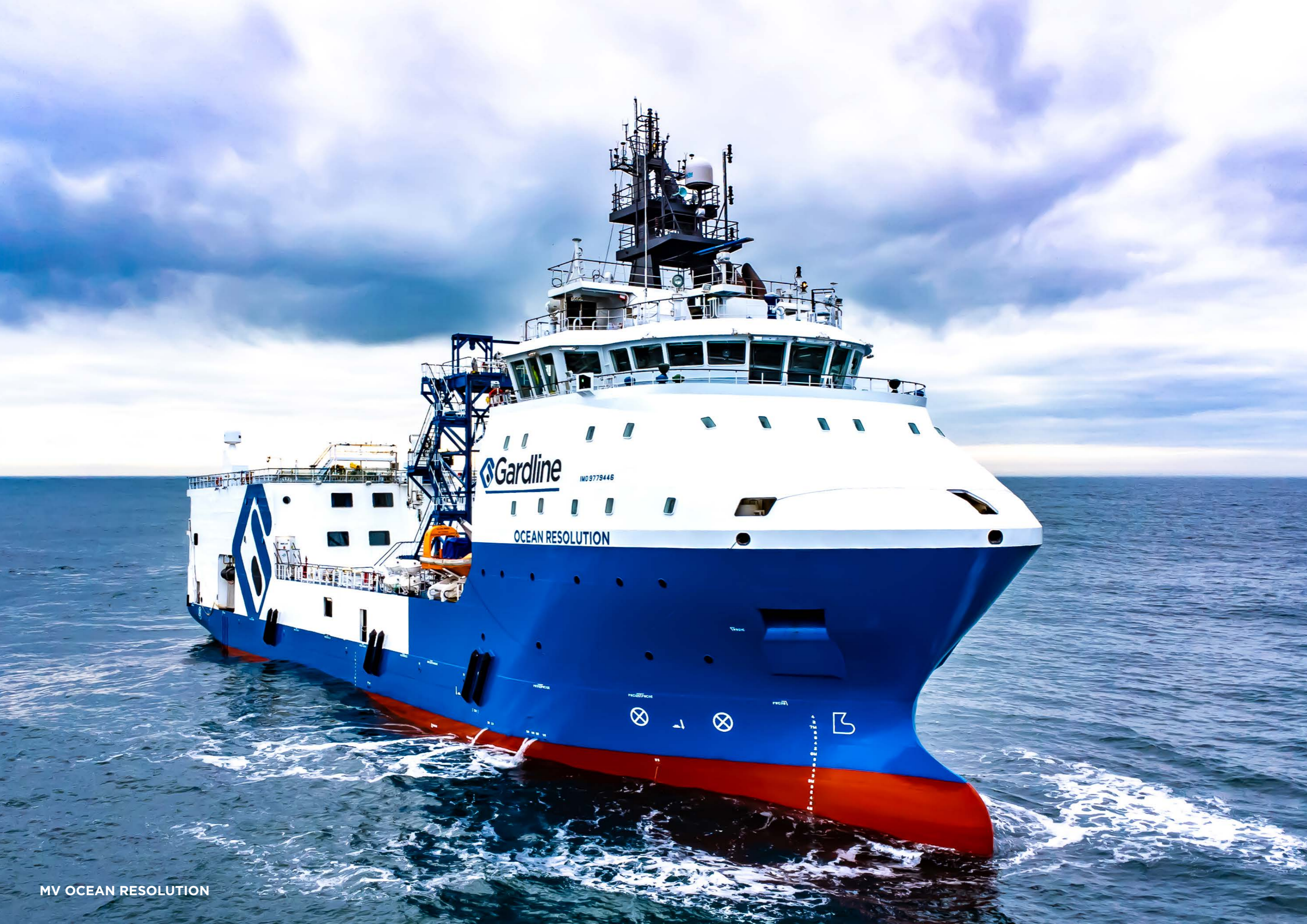
MV OCEAN RESOLUTION